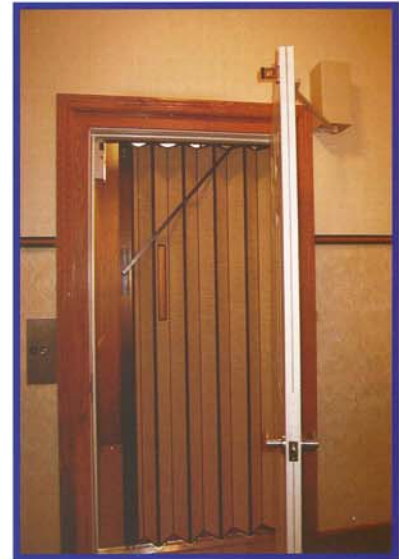
Shown: DS 4S (gate) & DS 4H (door)

The DS 4 continuously monitors position and swing rate, and the sophisticated software program can detect changes in opening or closing rate, and when obstructed, will reverse. If obstructed while opening, it will reverse and shut down. If obstructed while closing, it will reopen, go into the hold-open cycle, then attempt to close. It will repeat until the door can close.