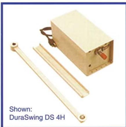
Shown: DuraSwing DS 4H