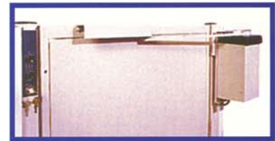
Shown: DS 4H (lift gate)